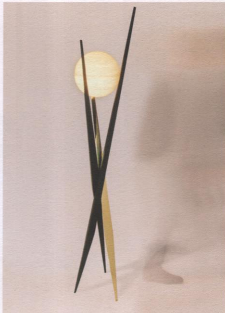
Backlit handcarved onyx and bronze piece from Achille Salvagni Atelier

'When it became clear that I wouldn't be able to organise and set up my shows in someone else's gallery with complete freedom, I decided to open my own space right in the heart of London,' he explains. 'If Rome is the best place in the world to find inspiration and create, London is the best window in Europe, the best place to show my work. It's culturally diverse and international in spirit, making it the best platform to connect with my high-end clientele.' achilleslavagni.com