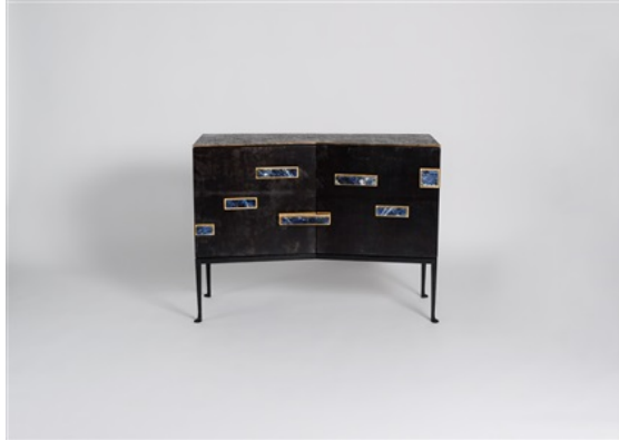
Achille Salvagni Palatino, 2016 Price on Request