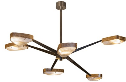
Achille Salvagni Spider Jewel , 2015 Price on Request