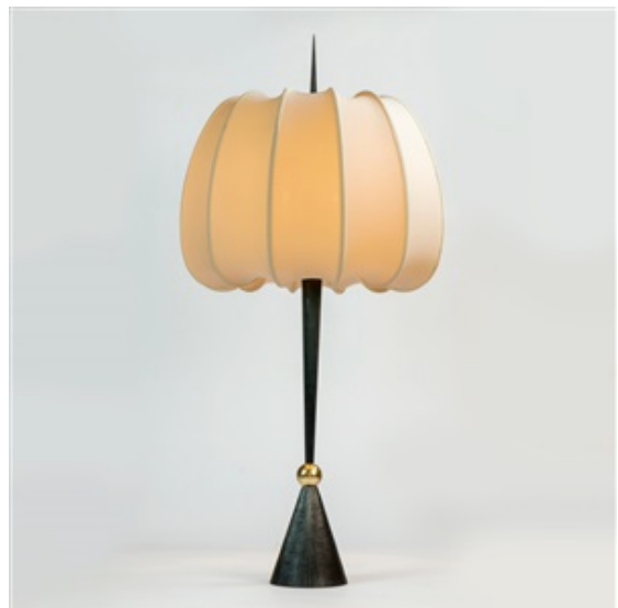
Achille Salvagni Lancea (Kyoto), 2017 Price on Request