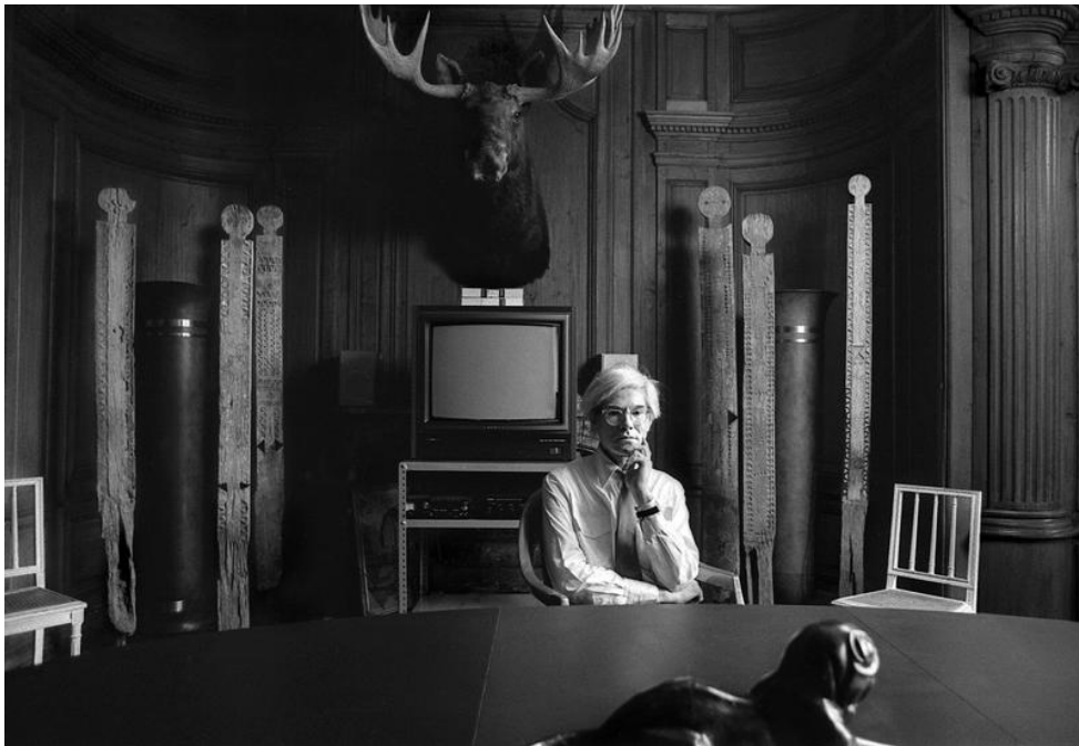
Andy Warhol