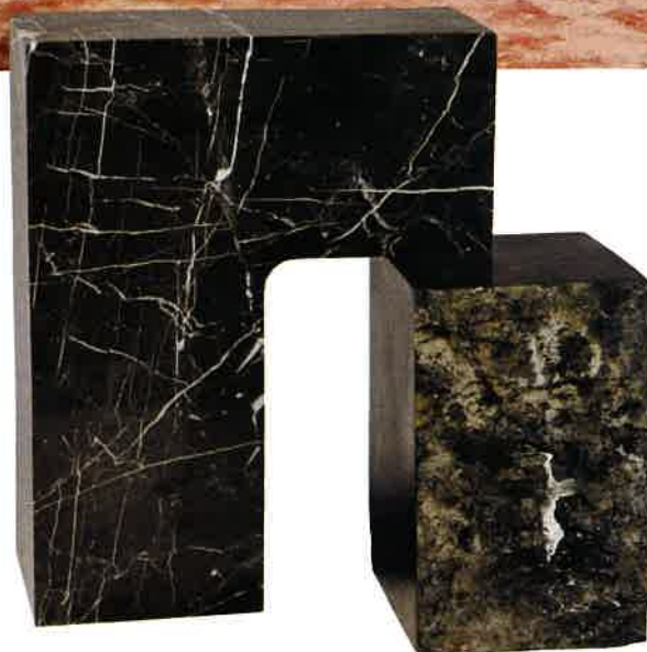
Right: Found II Side Table No. 1 by Dumlu Ozcan / aspacestudio.com Page 158