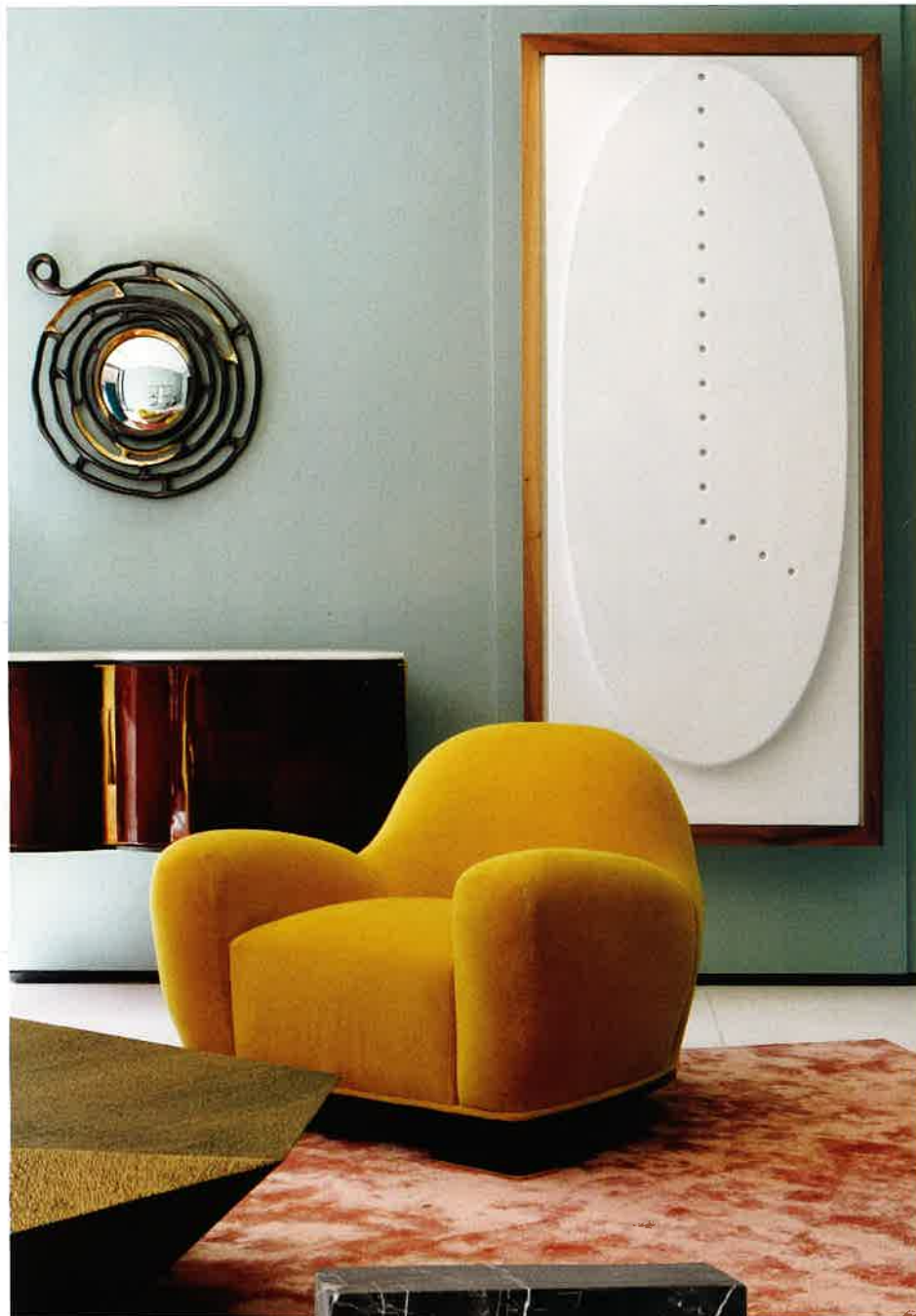
Above: Bespoke interior furnishings by Achille Salvagni, Page 104